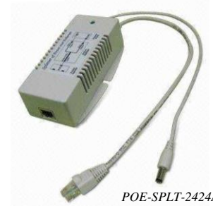
POE-SPLT-2424AC-G PoE Converter/Splitter