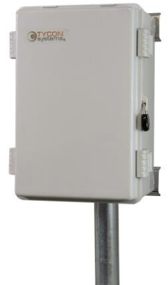
ENC-PL-15x11x6 Polycarbonate Enclosure

The enclosure is UV protected polycarbonate for long service life. All hardware is corrosion resistant.