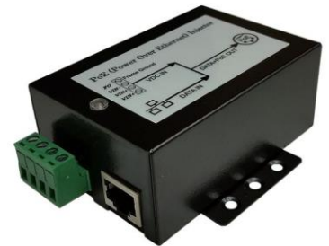
TP-DCDC-1248M (Metal Enclosure)