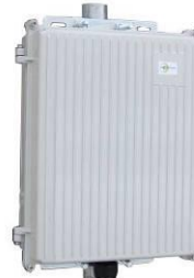
ENC-DC Die Cast Enclosure