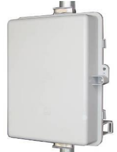
ENC-PL Polycarbonate Enclosure