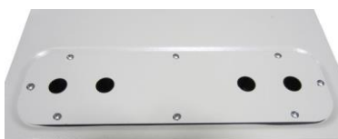
ENC-ST Bottom Panel Cutouts