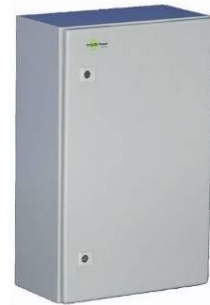
ENC-ST Steel Enclosure