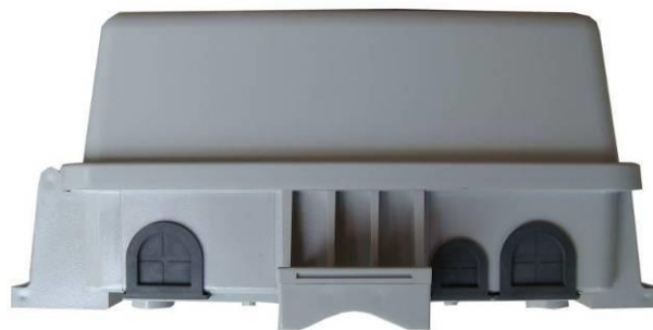
ENC-PL Bottom Panel with Universal Feedthru