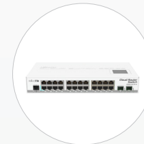
Cloud Router Switches